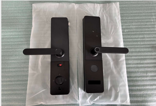
PRODUCT - FRONT VIEW