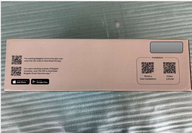
PRODUCT BOX BARCODE