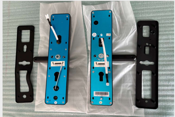
PRODUCT - BACK VIEW