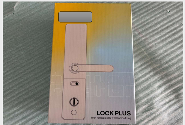
PRODUCT BOX PACKING