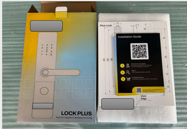
PRODUCT BOX PACKING