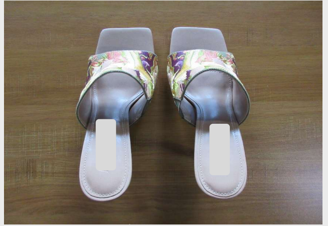
SAMPLE BACK VIEW