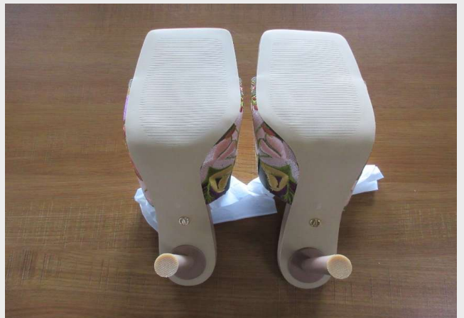
SAMPLE BACK VIEW