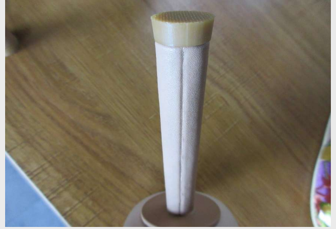
SAMPLE HEEL VIEW