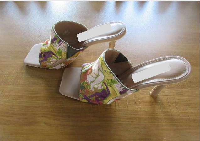
SAMPLE SIDE VIEW