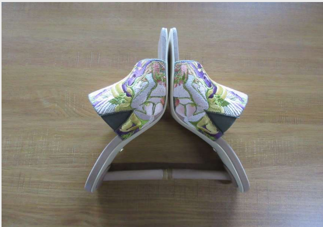
SAMPLE SIDE VIEW