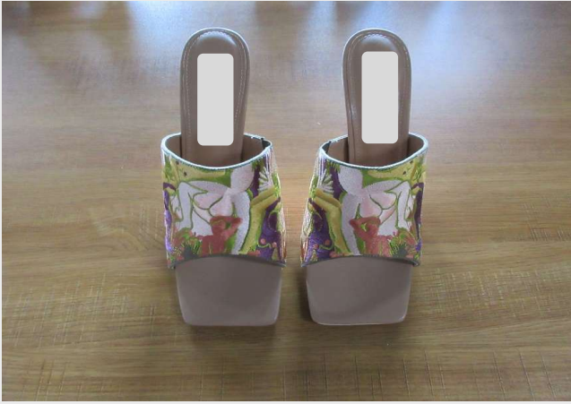
SAMPLE FRONT VIEW