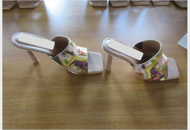
SAMPLE SIDE VIEW