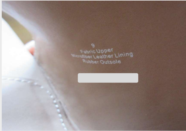
SAMPLE LABEL PRINTING