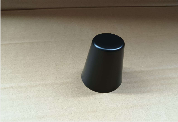
SHADE HOLDER SLEEVE