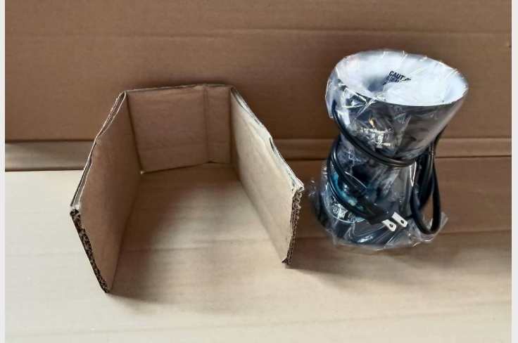
PRODUCT PACK VIEW