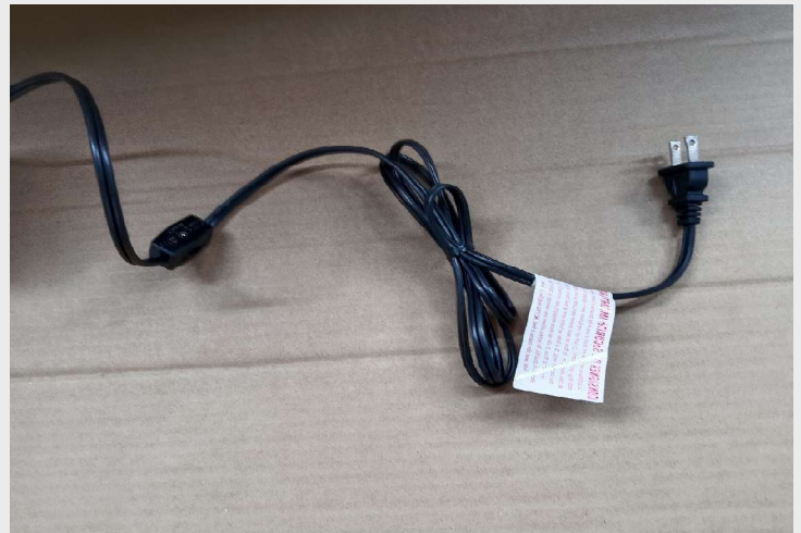
LAMP INPUT CABLE