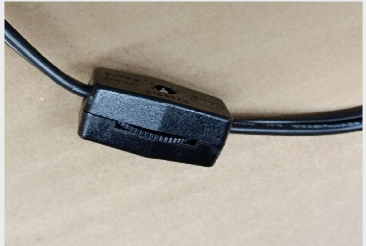
LAMP SWITCH CONTROL