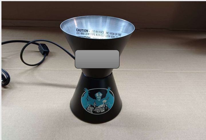
LAMP BASE HOLDER