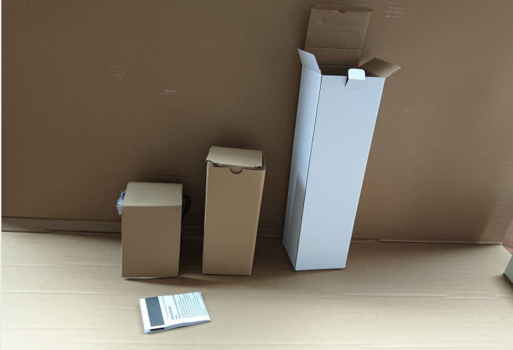
PRODUCT PACK VIEW