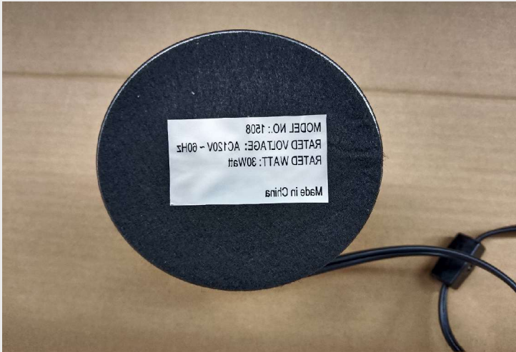
LAMP HOLDER BASE