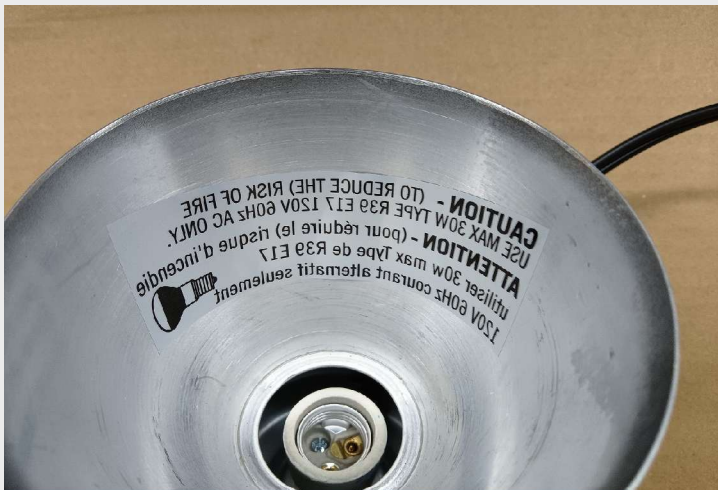
LAMP WARNING INSTRUCTIONS.