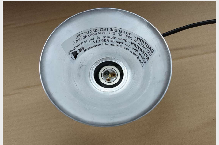
LAMP WARNING INSTRUCTIONS.