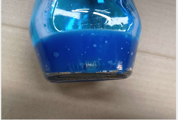
DECORATIVE BOTTLE LIQUID