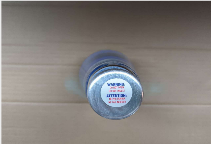
LAMP DECORATIVE TOP CAP