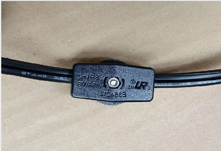
LAMP SWITCH CONTROL