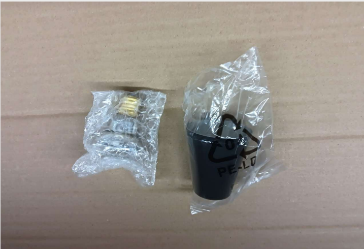
SHADE HOLDER SLEEVE & LAMP