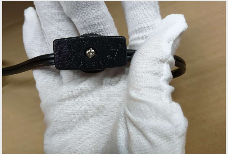
LAMP SWITCH CONTROL