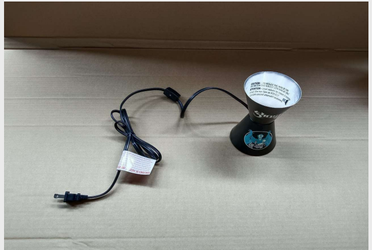
LAMP BASE HOLDER