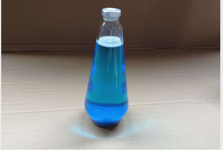
LAMP DECORATIVE TOP