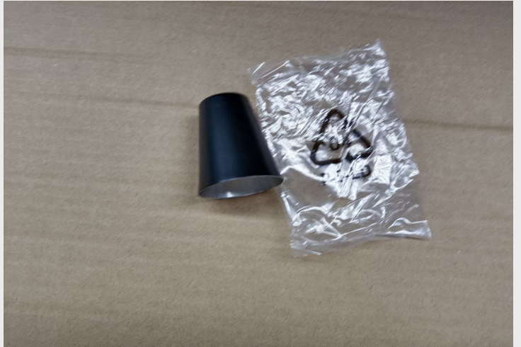
SHADE HOLDER SLEEVE