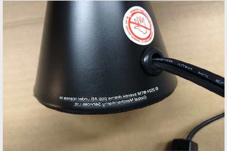
AMP HOLDER WIRE