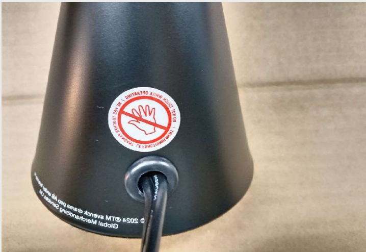
LAMP HOLDER WIRE