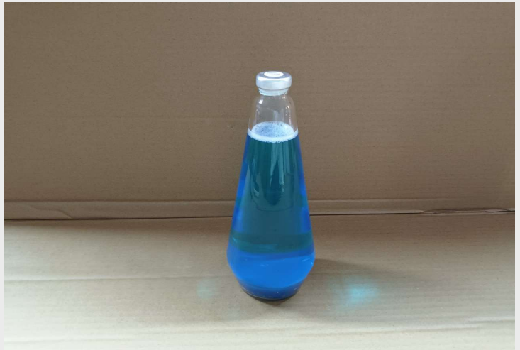
LAMP DECORATIVE TOP