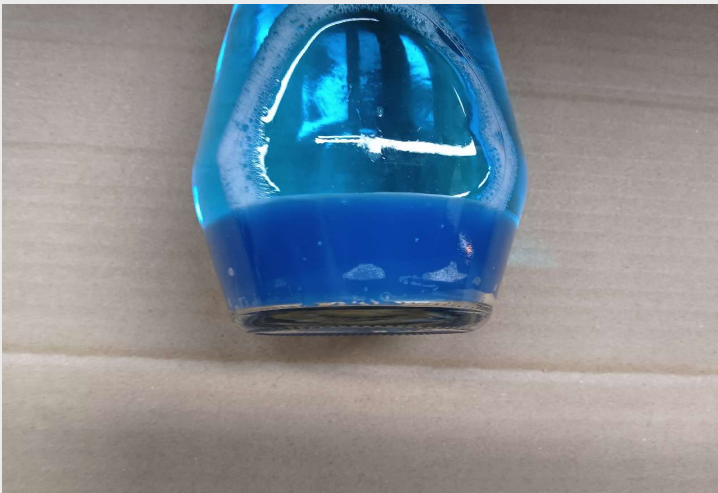
DECORATIVE BOTTLE LIQUID