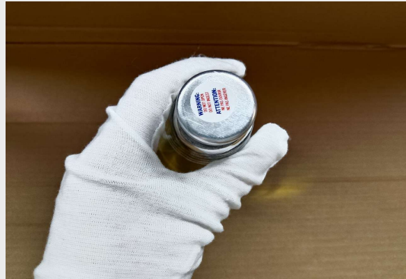
DECORATIVE TOP CAP