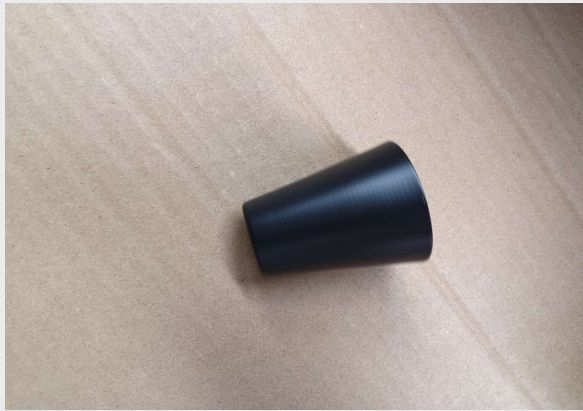
SAMPLE SHADE HOLDER SLEEVE