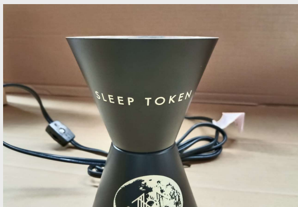
SAMPLE BULB HOLDER