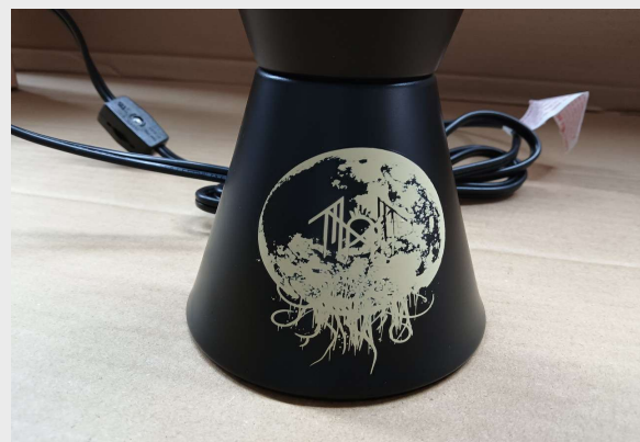
SAMPLE BULB HOLDER