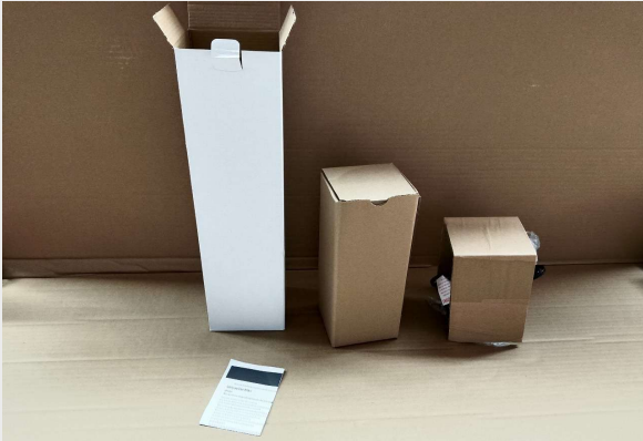
SAMPLE BOX PACKING