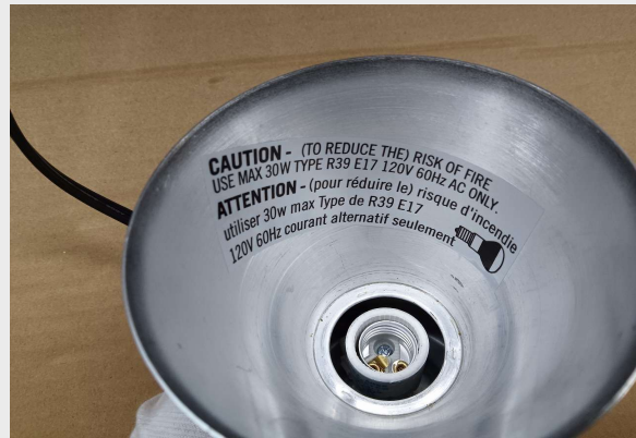
HOLDER WARNING INSTRUCTION