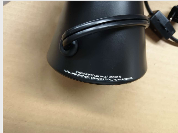
BULB HOLDER INPUT WIRE