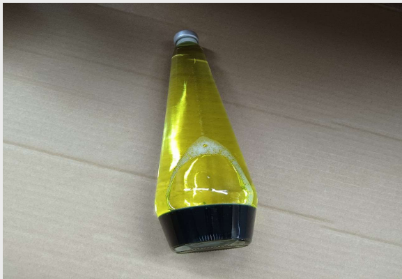
TOP LIQUID LEVEL