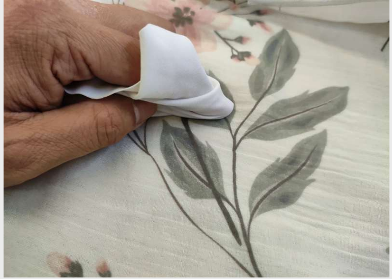
PRINT DRY RUB CHECK