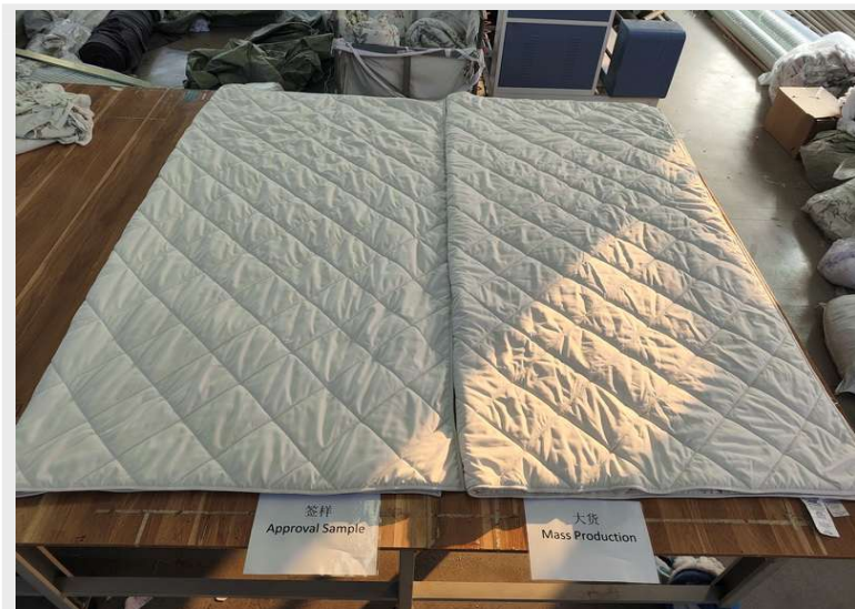
ARTWORK COMPARED TO APPROVED SAMPLE