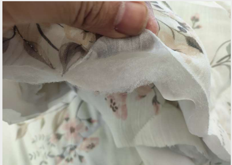
INTERNAL FILLING CHECK