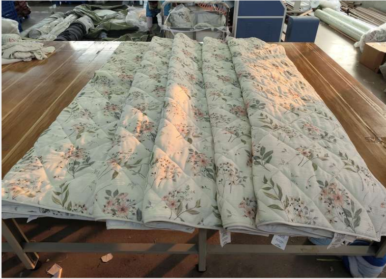
SHADE CHECK IN BULK