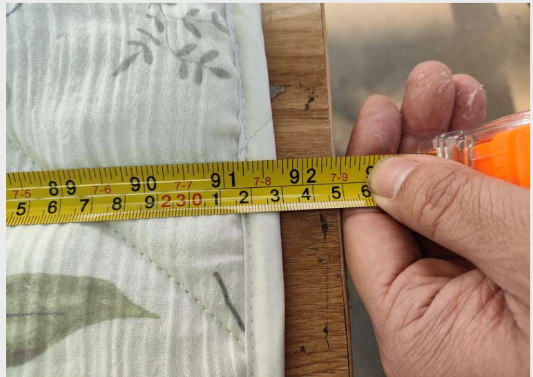
PRODUCT SIZE CHECK