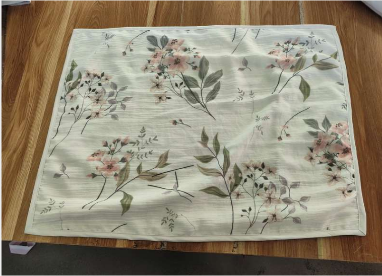
PILLOW FRONT VIEW (20*36in)