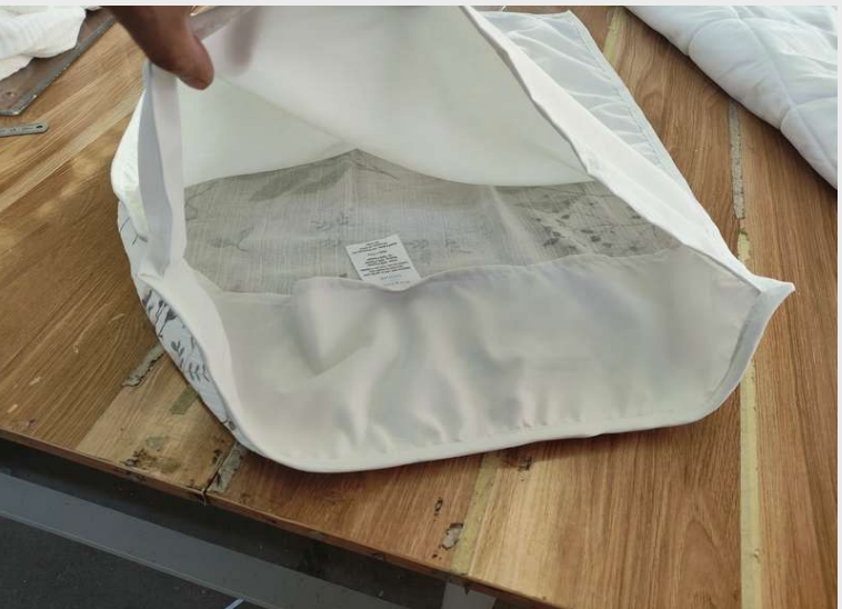
BOTTOM HEM VIEW