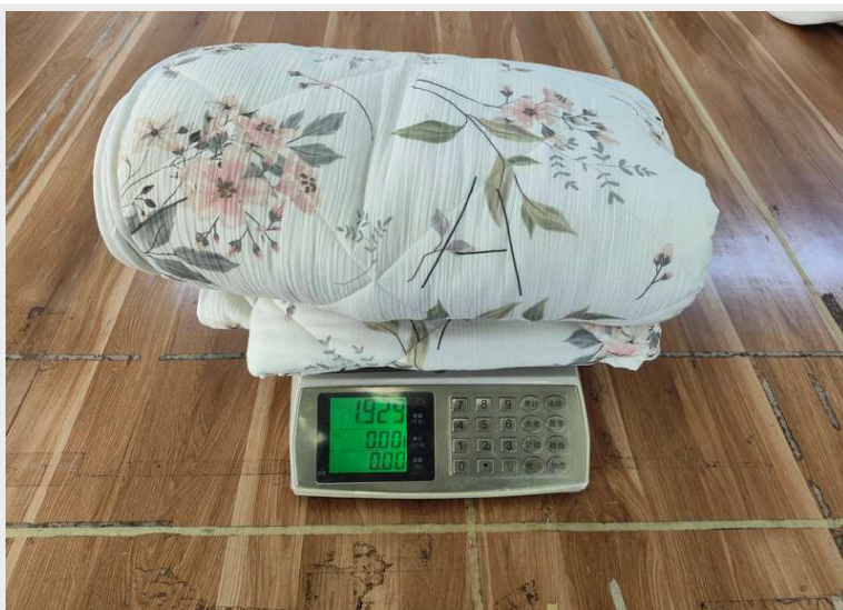
PRODUCT WEIGHT CHECK