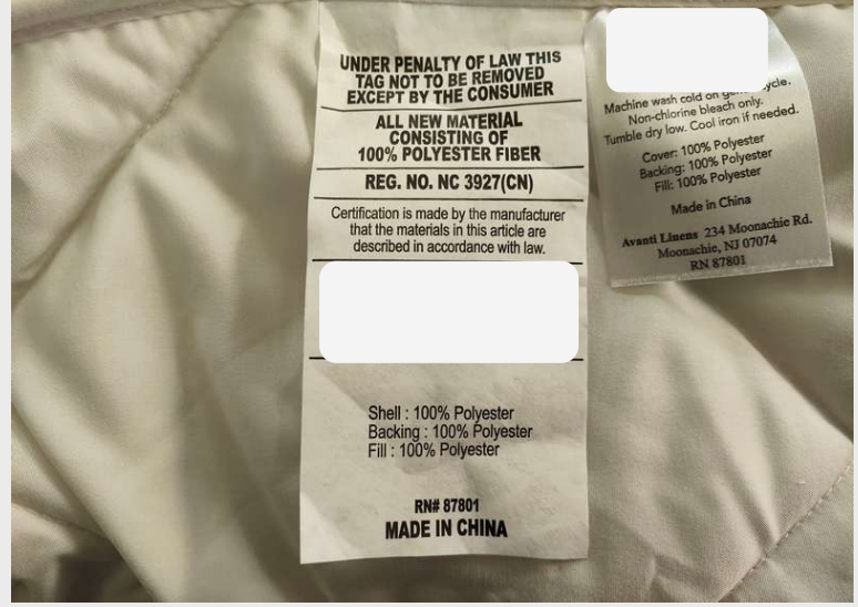
QUILT LAW LABEL