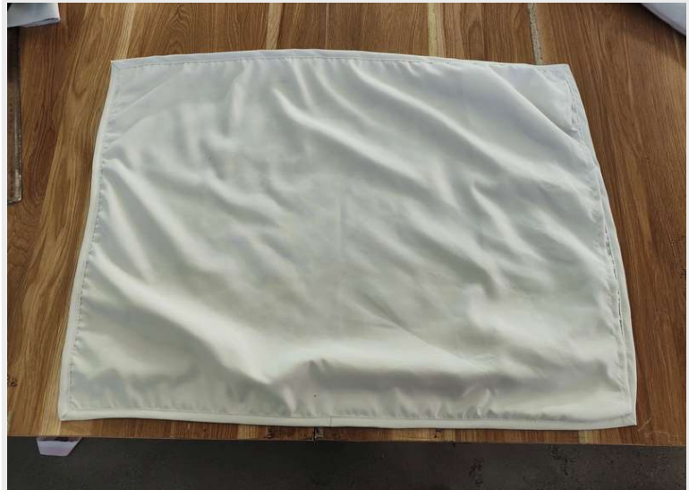
PILLOW BACK VIEW (20*36in)