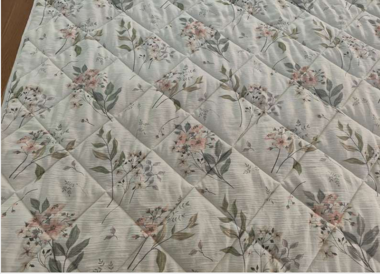
QUILT ARTWORK VIEW