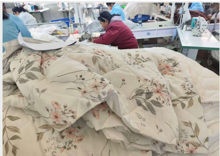
BULK IN PRODUCTION LINE