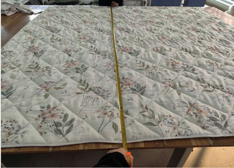
PRODUCT SIZE CHECK