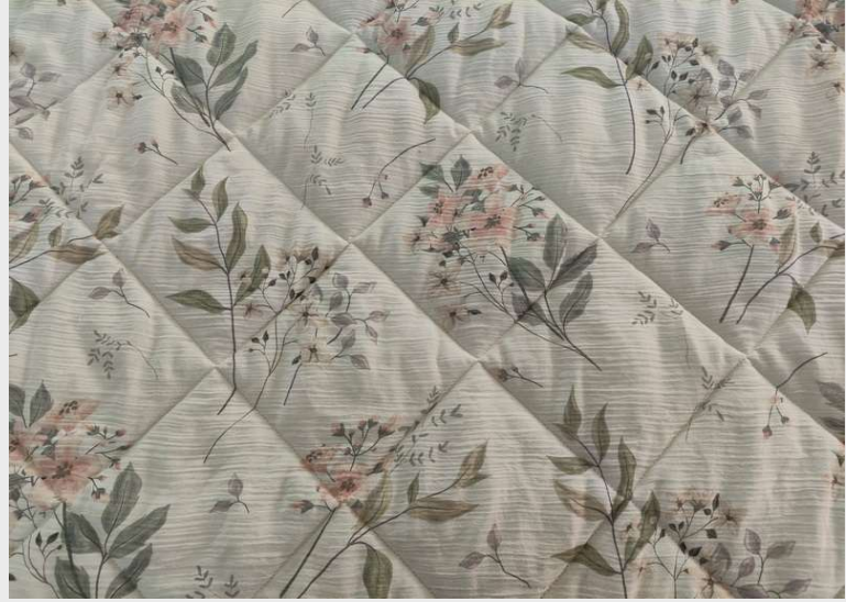
QUILT ARTWORK VIEW