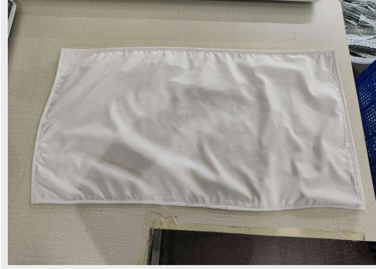
PILLOW BACK VIEW(20*36in)