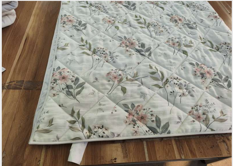
QUILT ARTWORK VIEW