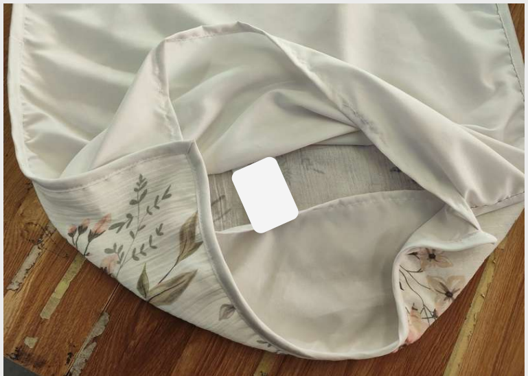
BOTTOM HEM INSIDE VIEW