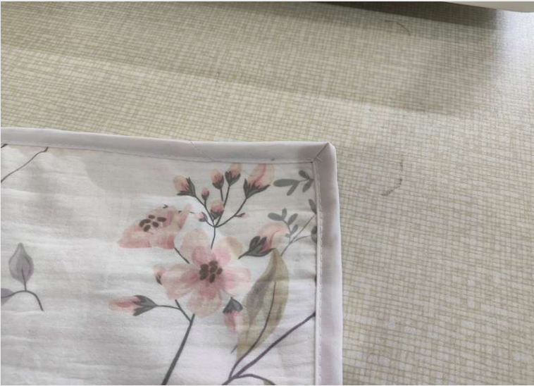
QUILT ARTWORK VIEW