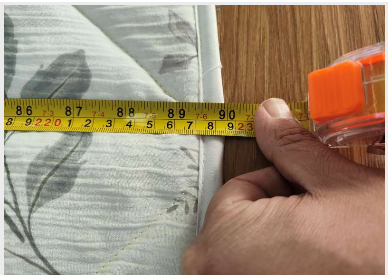
PRODUCT SIZE CHECK