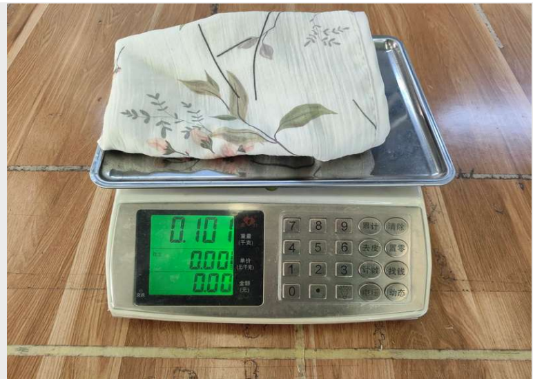
PRODUCT WEIGHT CHECK