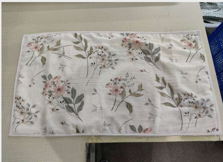
PILLOW FRONT VIEW (20*36in)