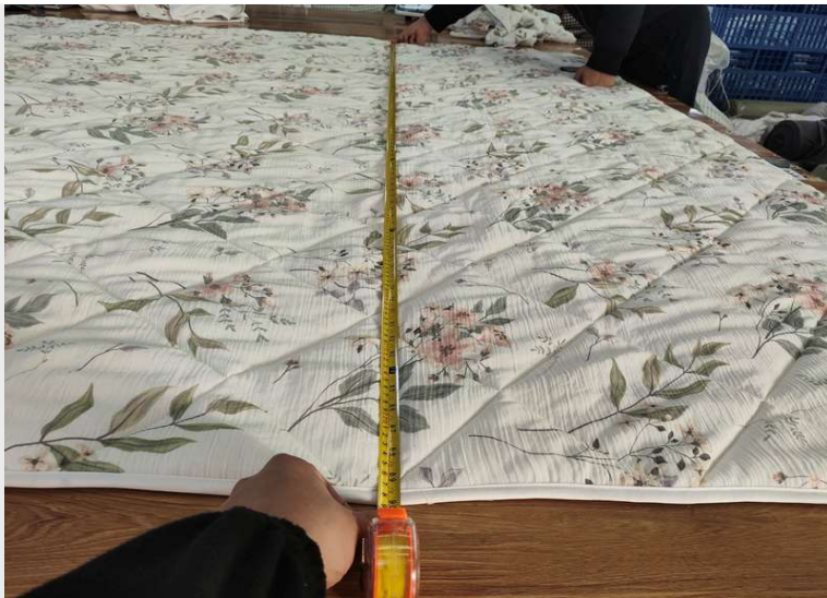
PRODUCT SIZE CHECK