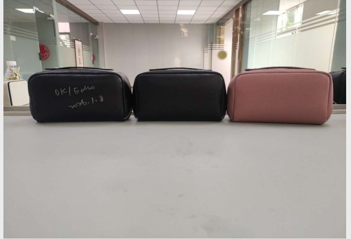
APPROVED SAMPLE VS BULK