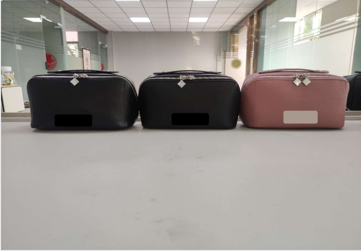
APPROVED SAMPLE VS BULK