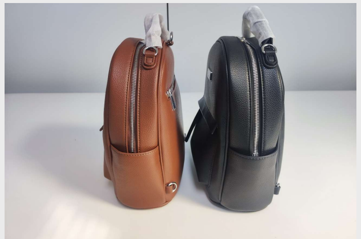
SAMPLE BACK VIEW