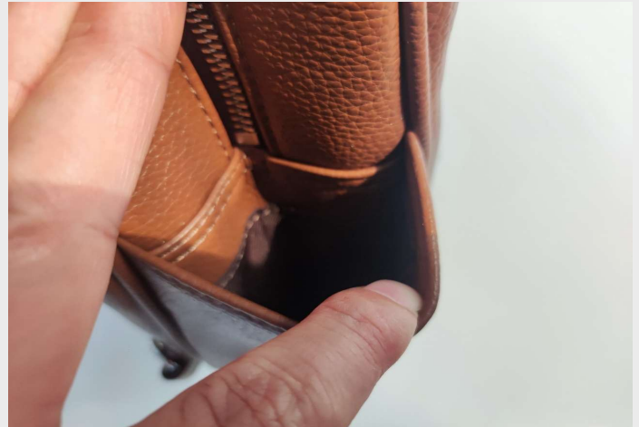
SAMPLE SIDE POCKET