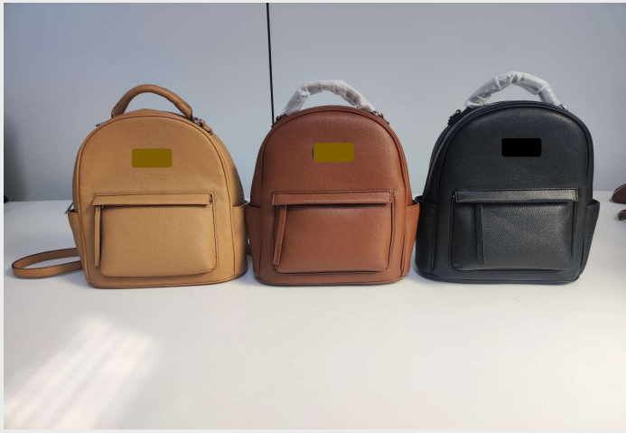
SAMPLE FRONT VIEW