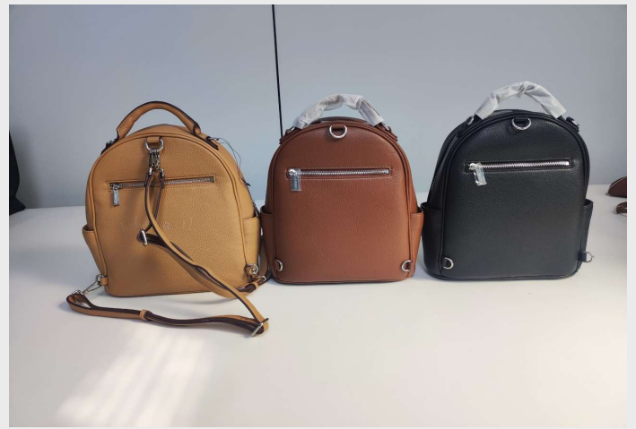
SAMPLE BACK VIEW