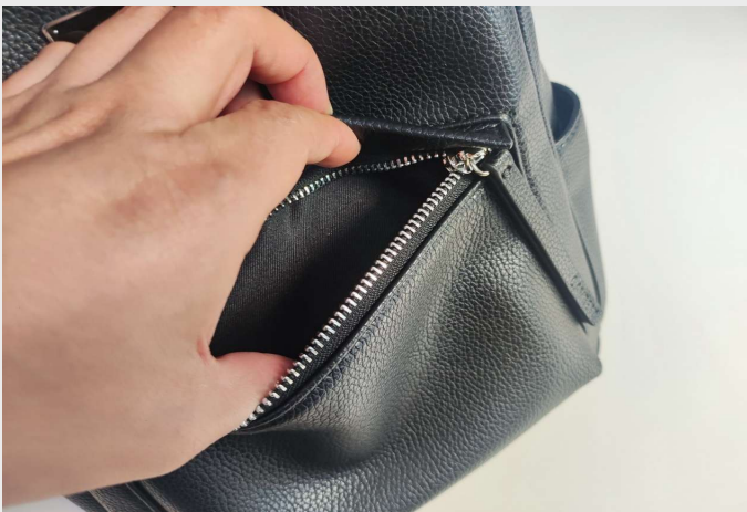
SAMPLE POCKET VIEW