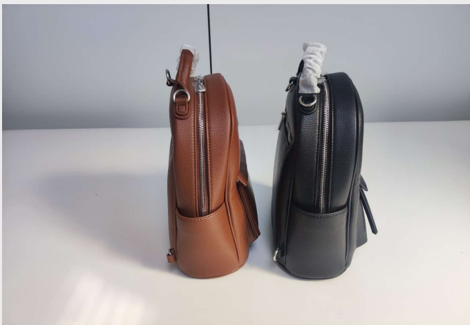
SAMPLE SIDE VIEW