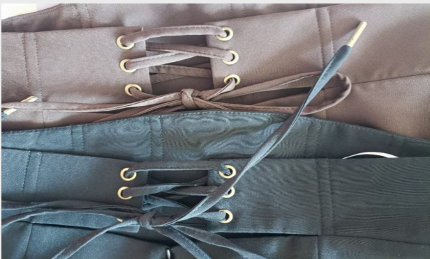
SELF FABRIC DRAWCORD