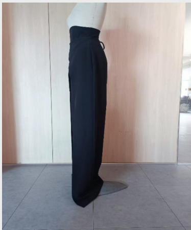
GARMENT RIGHT SIDE