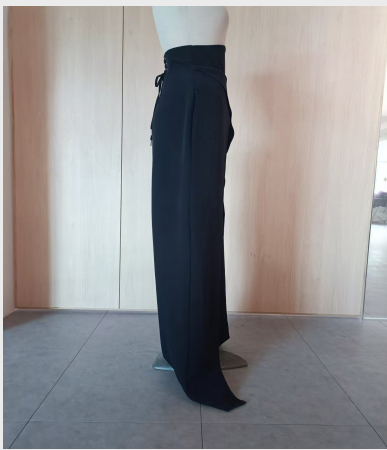
GARMENT LEFT SIDE