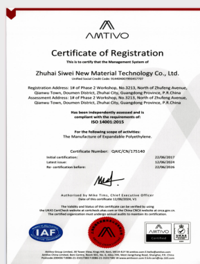
Certificate Name ISO 14001:2015