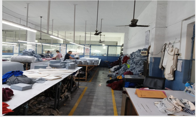
Production Line - 2