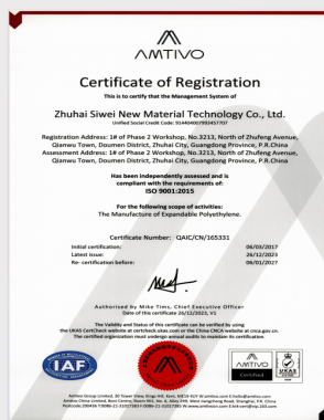
Certificate Name ISO 9001:2015