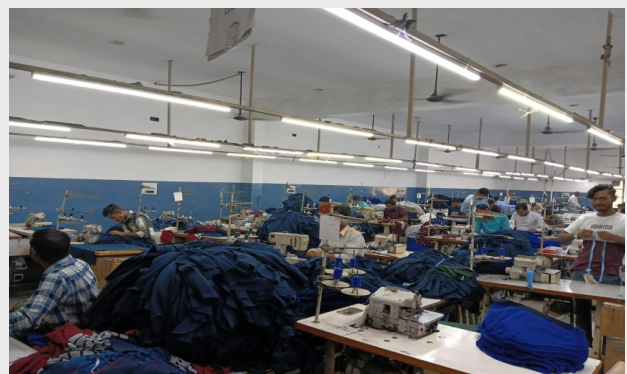
Production Line - 4