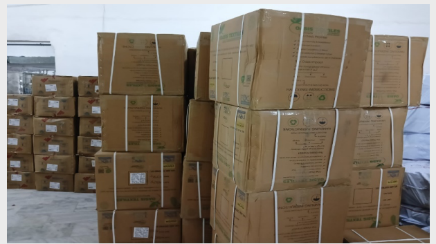
Carton Storage Warehouse