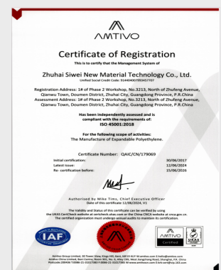
Certificate Name ISO 45001:2018