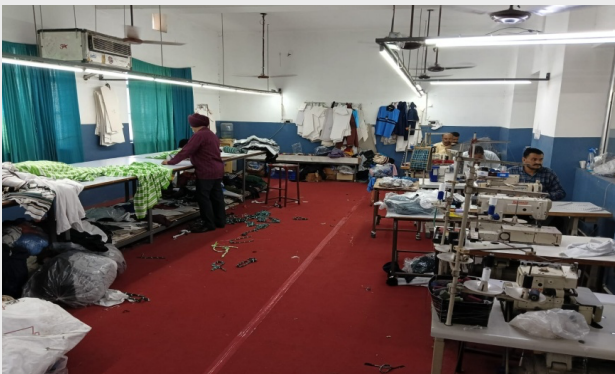
Production Line - 1