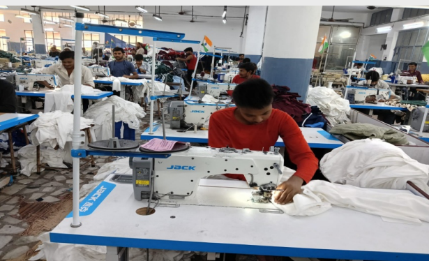
Production Line - 3