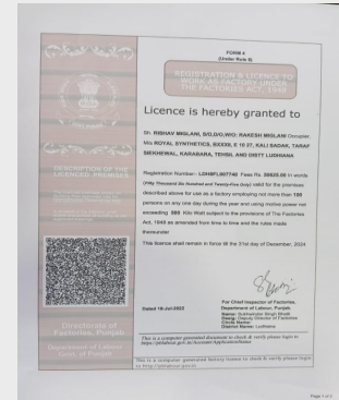
Certificate Name Factory License (1948)